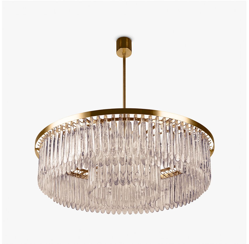
CL463-3T-100 in Clear and Smoke Scallop Glass and Brushed Gold