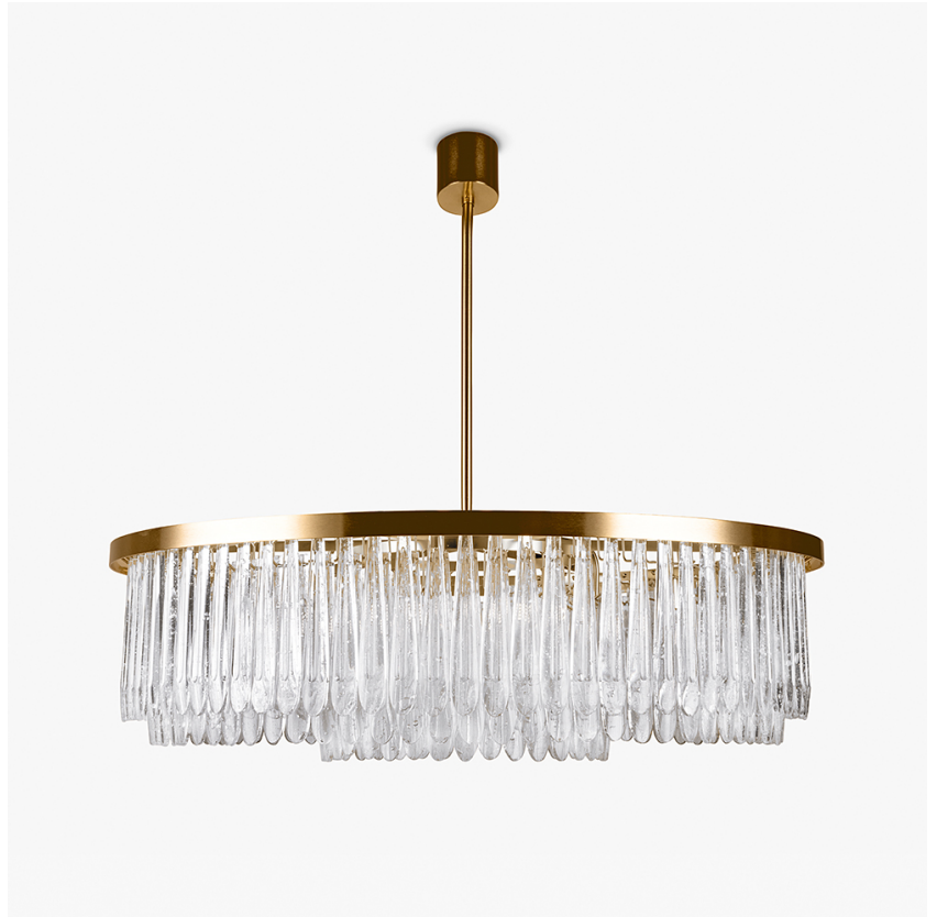
CL463-3T in Clear Scallop Glass and Brushed Gold