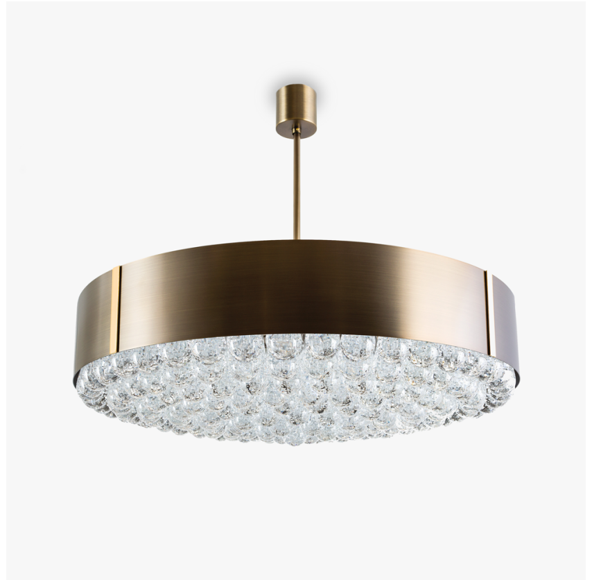
CL458-80 in Clear Bubbled and Brushed Bronze with Polished Gold Thin Decorative Bands