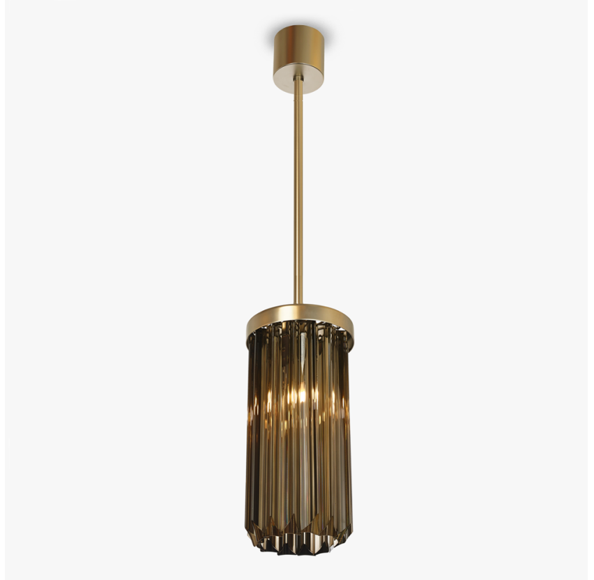
CL455 in Smoke Triangular Angle Cut Glass and Brushed Gold

IEC (International Electrotechnical Commission) test certificates available - will incur a surcharge UL (Underwriters Laboratories) test certificates available for the USA - will incur a surcharge