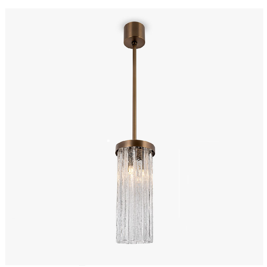
CL455 in Clear Crackled and Brushed Bronze