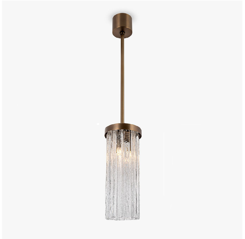
CL455 in Clear Cracked and Brushed Bronze