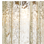
Clear Hammered (Flat)