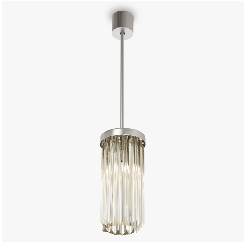
CL455 in Clear Triangular Angle Cut Murano Glass and Brushed Nickel

UL (Underwriters Laboratories) test certificates available for the USA - will incur a surcharge