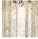
Clear Hammered (Flat)