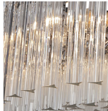
Clear Triangular Flat Cut