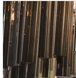
Smoke Triangular Flat Cut