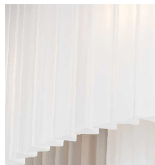
Satin Triangular Flat Cut