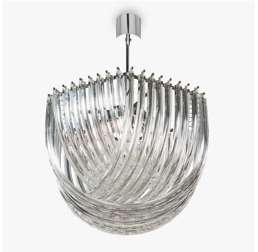
CL444-60 in Clear Murano Glass and Chrome