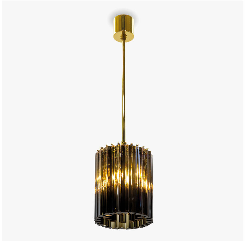
CL412-25 in Smoke Triangular Flat Cut Murano Glass and Polished Gold

UL (Underwriters Laboratories) test certificates available for the USA - will incur a surcharge IEC (International Electrotechnical Commission) test certificates available - will incur a surcharge