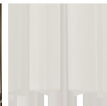
Satin Flat Triangular