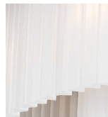
Satin Triangular Flat Cut