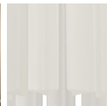
Satin Flat Triangular