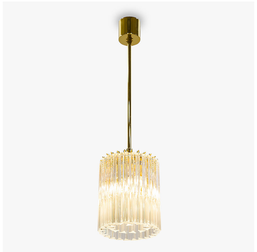
CL412-25 in Clear Triangular Flat Cut Murano Glass and Polished Gold

IEC (International Electrotechnical Commission) test certificates available - will incur a surcharge