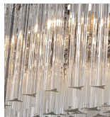
Clear Triangular Flat Cut