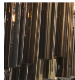
Smoke Triangular Flat Cut