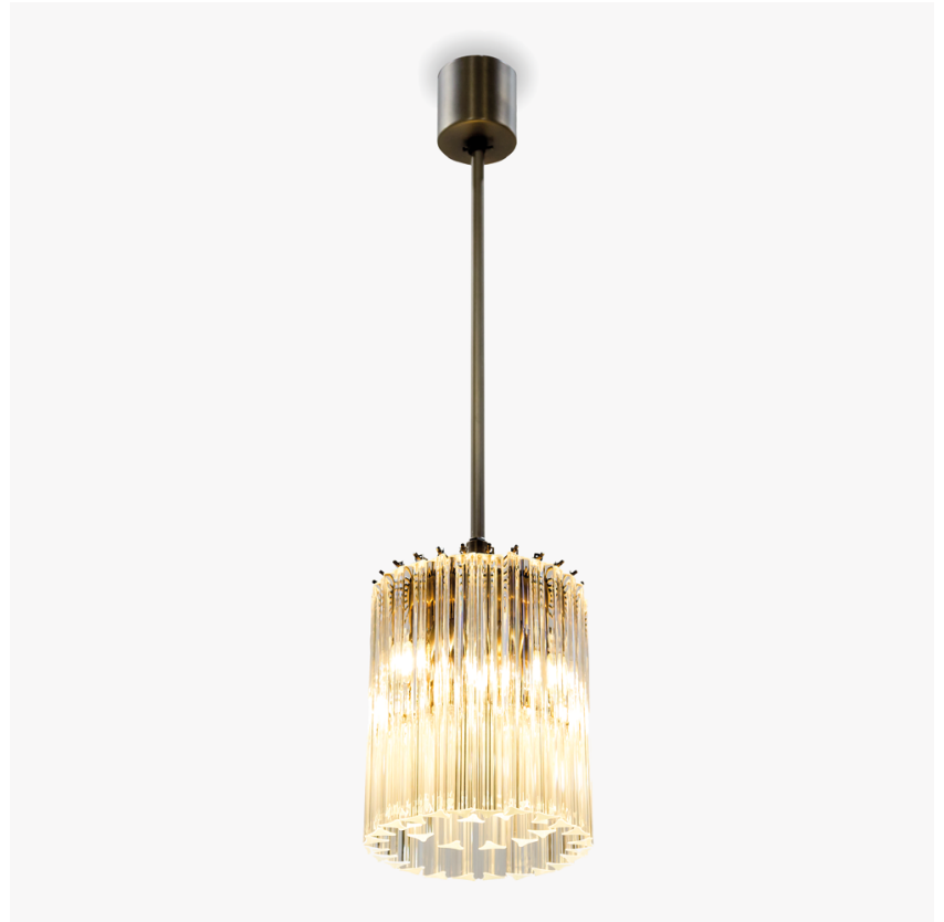
CL412-25 in Clear Triangular Flat Cut Glass and Brushed Bronze

UL (Underwriters Laboratories) test certificates available for the USA - will incur a surcharge IEC (International Electrotechnical Commission) test certificates available - will incur a surcharge