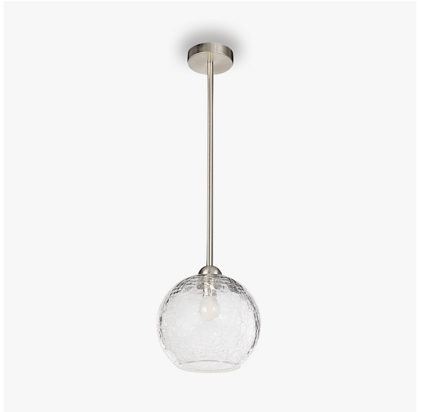
CL375 in Clear Crackled and Brushed Nickel