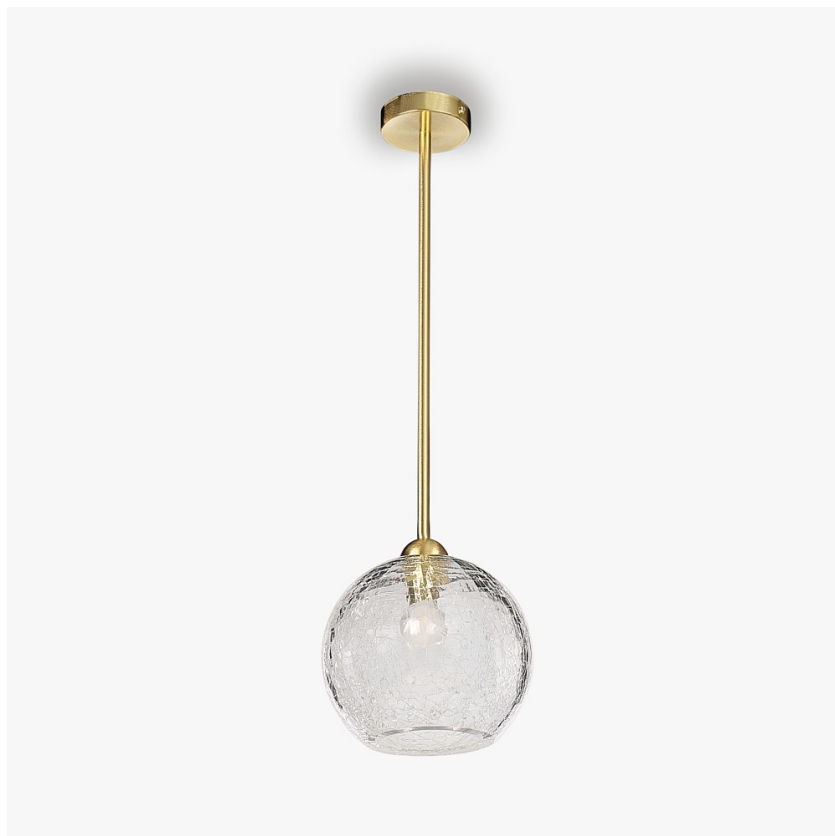
CL375 in Clear Crackled and Brushed Gold