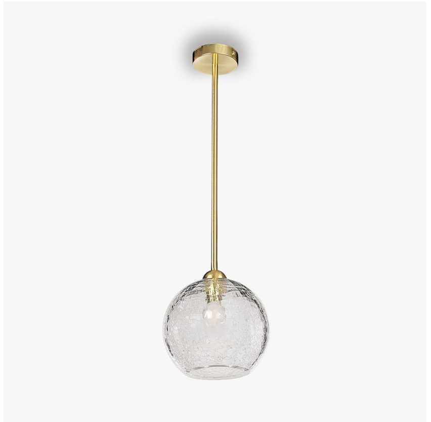
CL375 in Clear Crackled and Brushed Gold