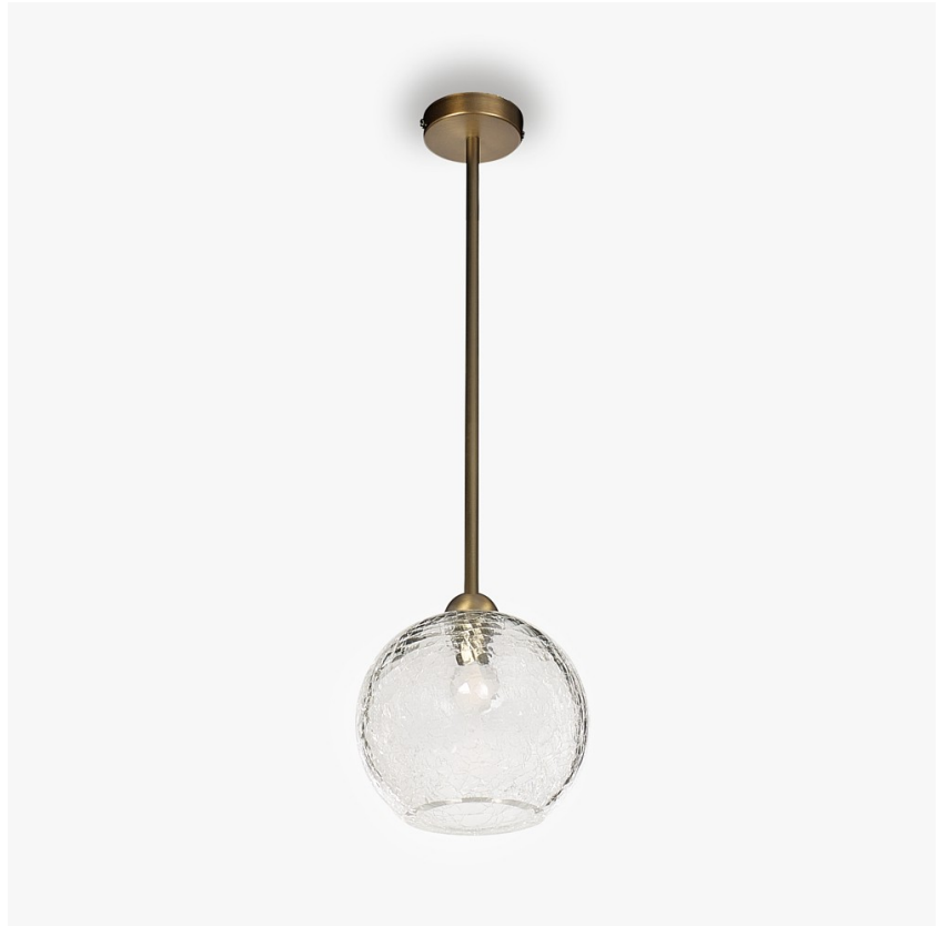
CL375 in Clear Cracked and Brushed Bronze