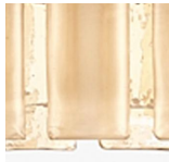
Lunar Champagne & Champagne Satin