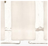
Lunar Clear & Clear Satin