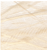
Clear Hand-Carved Lucite