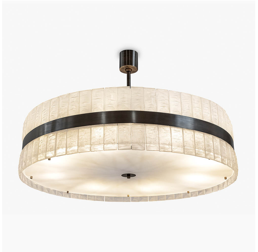
CL132-100 with Hand-carved Lucite and Bronze