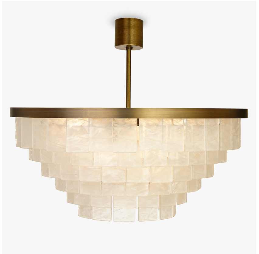
CL125-75 in Clear Hand-carved Lucite and Brushed Bronze