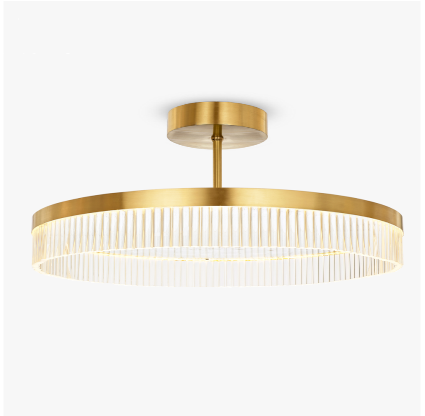
CL123-S-100 in Clear Lucite Rods and Brushed Gold with Distressed Mirror