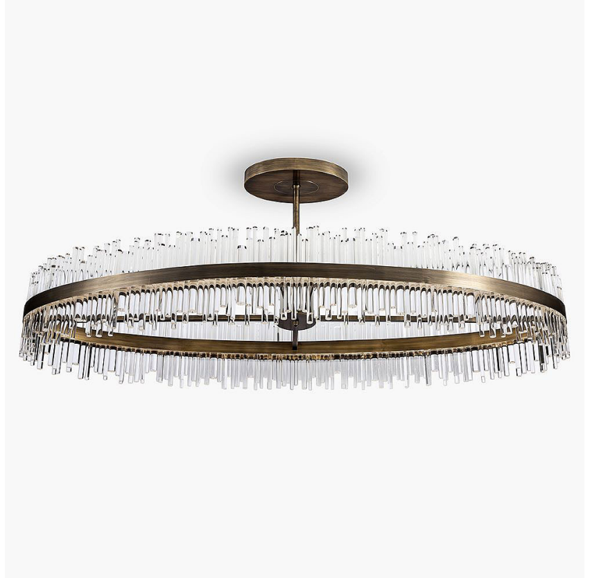
CL122-OVAL-200 in Clear Lucite and Brushed Bronze