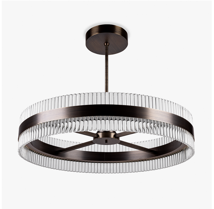
CL121-LED in Clear Lucite and Brushed Bronze