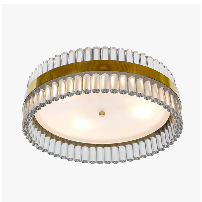
CL121-40-FM with Clear Lucite and Polished Gold