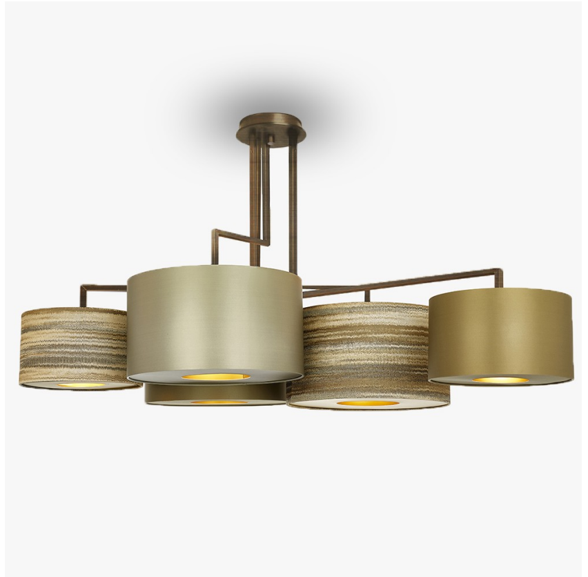
CL100-5 in Brushed Bronze with 16" Shades in COM Fabric 'Idrios Patina' from Romo and 1806W Timber Wolf