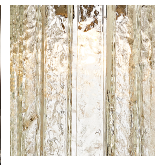
Clear Hammered (Flat)