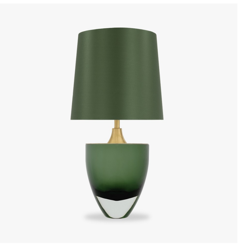
TL714-SM in Forest Green & Clear and Brushed Gold with 12" Walton Shade in Bennett's Dill Crepe Satin 120