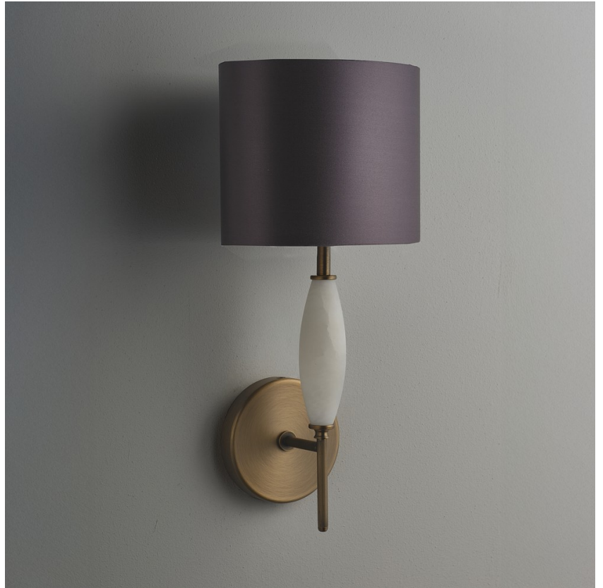
WL827-SM in Alabaster and Brushed Bronze with 8" Oval in Bennett Silks 1806W-21 Slate