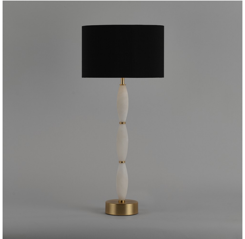
TL827-LA in Alabaster and Brushed Gold with 12" Oval in Bennett Silks 5018W-52 Black Dupion