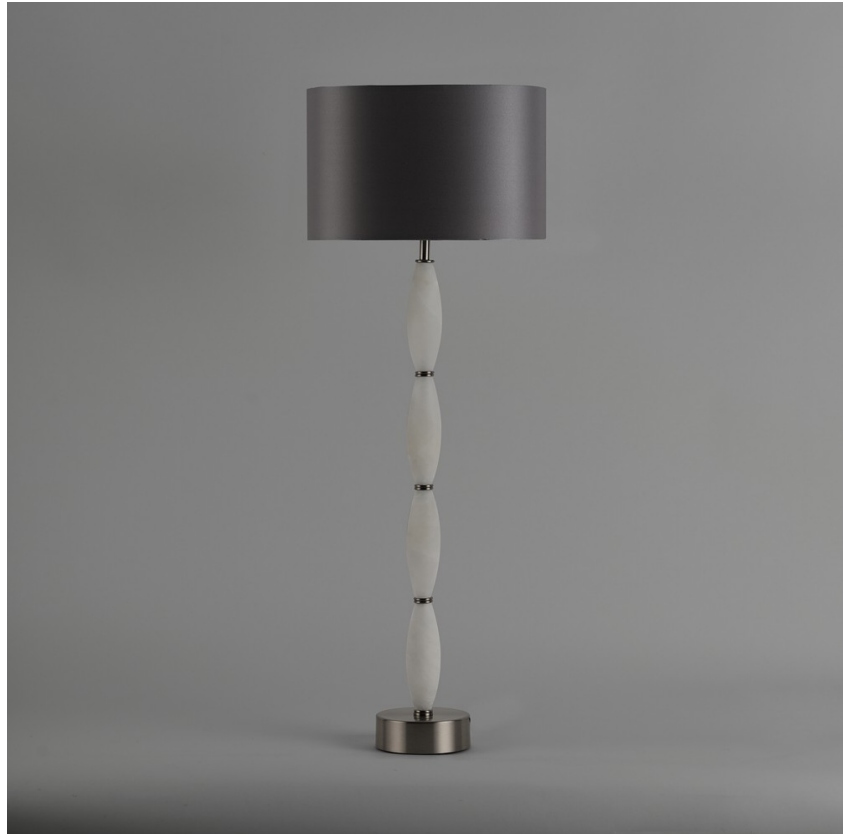
TL827-LA in Alabaster and Brushed Nickel with 12" Oval in Bennett Silks 1806W-817 Heron