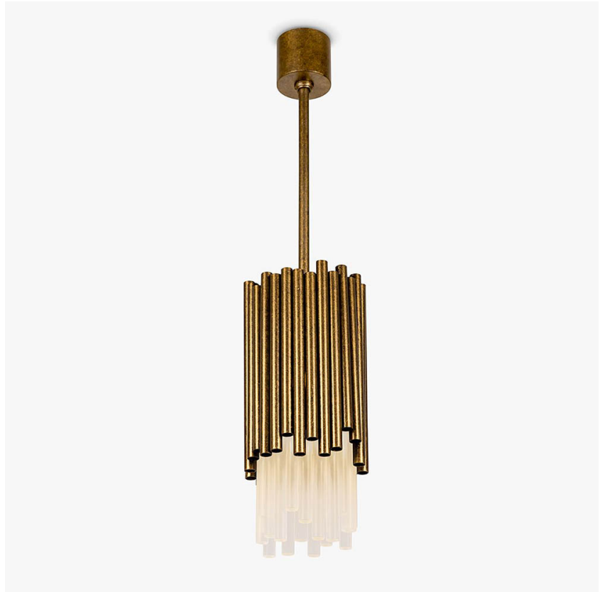
CL109-PEN in Frosted and Stippled Gold

IEC (International Electrotechnical Commission) test certificates available - will incur a surcharge