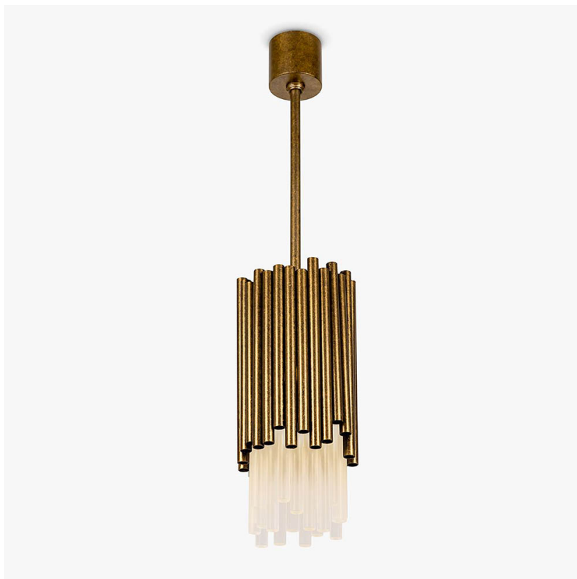
CL109-PEN in Frosted and Stippled Gold

IEC (International Electrotechnical Commission) test certificates available - will incur a surcharge