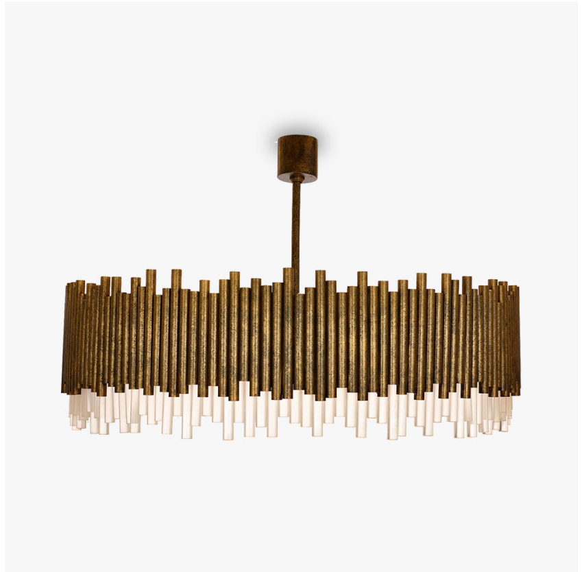
CL109-100 in Frosted Lucite Rods and Distressed Bronze Rods

IEC (International Electrotechnical Commission) test certificates available - will incur a surcharge