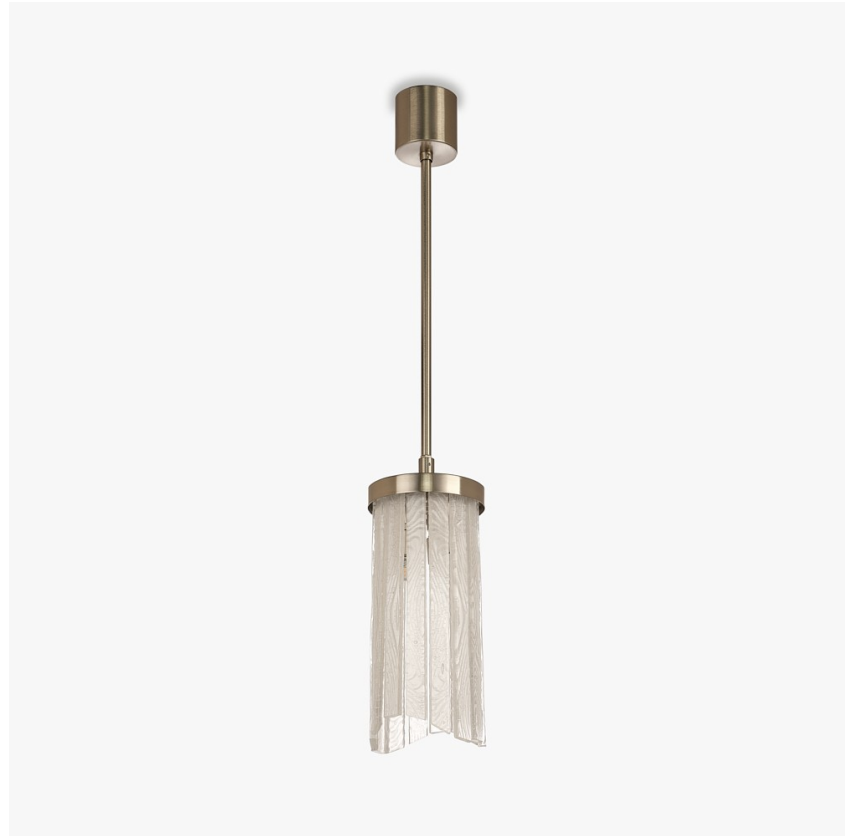
CL806-PEN in Brushed Nickel