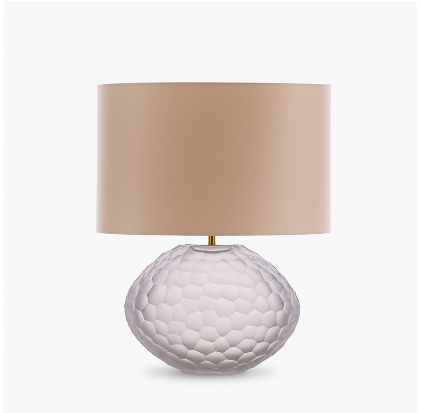
TL234 in Clear glass and Brushed gold with a 15" Oval shade in crepe satin 1806W 012 Frosted Almond