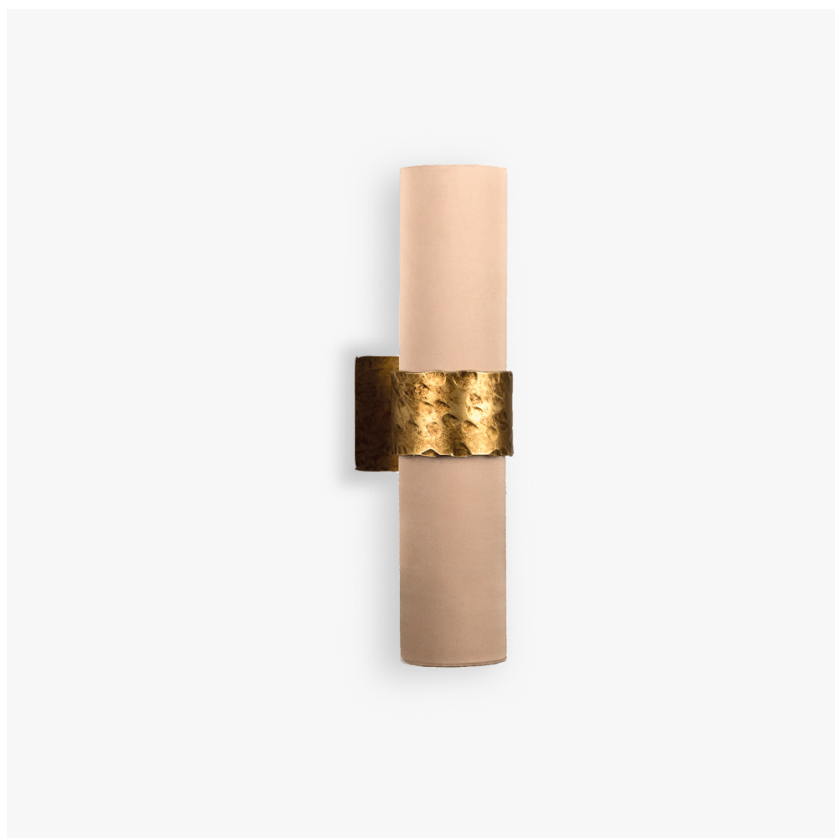
WL57 in Hammered Antique Gold and WL57-Shades in Crepe Satin 1806W-012 Frosted Almond