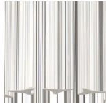
Clear Flat Triangular