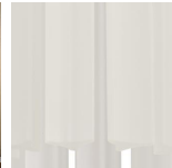
Satin Flat Triangular