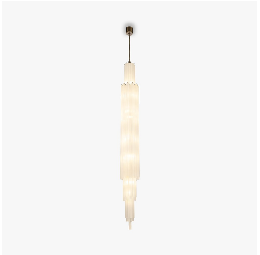
CL460-160 in Satin Triangular Flat Cut and Brushed Bronze

UL (Underwriters Laboratories) test certificates available for the USA - will incur a surcharge IEC (International Electrotechnical Commission) test certificates available - will incur a surcharge