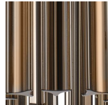
Smoke Flat Triangular