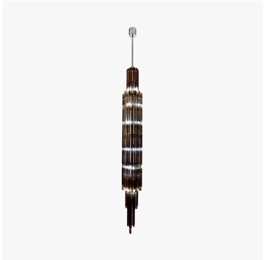
CL460-160 in Smoke Triangular Flat Cut and Chrome

certificates available - will incur a surcharge