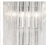
Clear & Silver Triangular Flat Cut