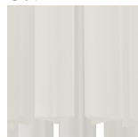
Satin Flat Triangular