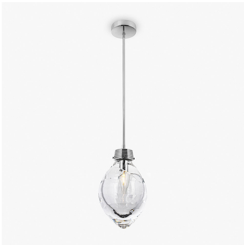
CL660-PEN in Clear Glass and a Polished Nickel Rod