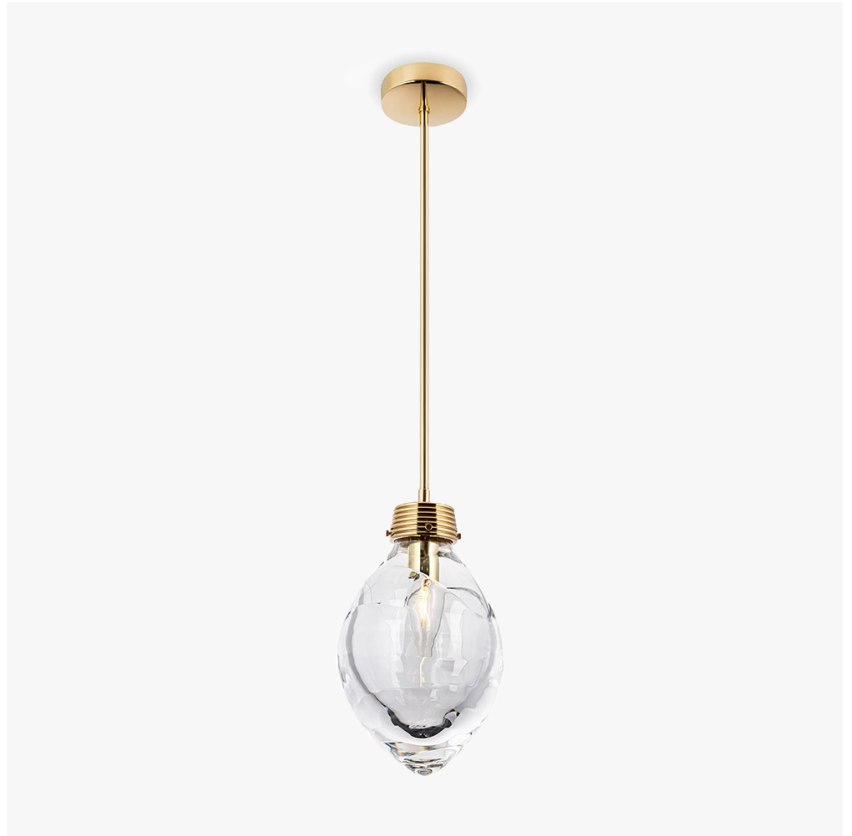
CL660-PEN in Clear Glass and Polished Brass