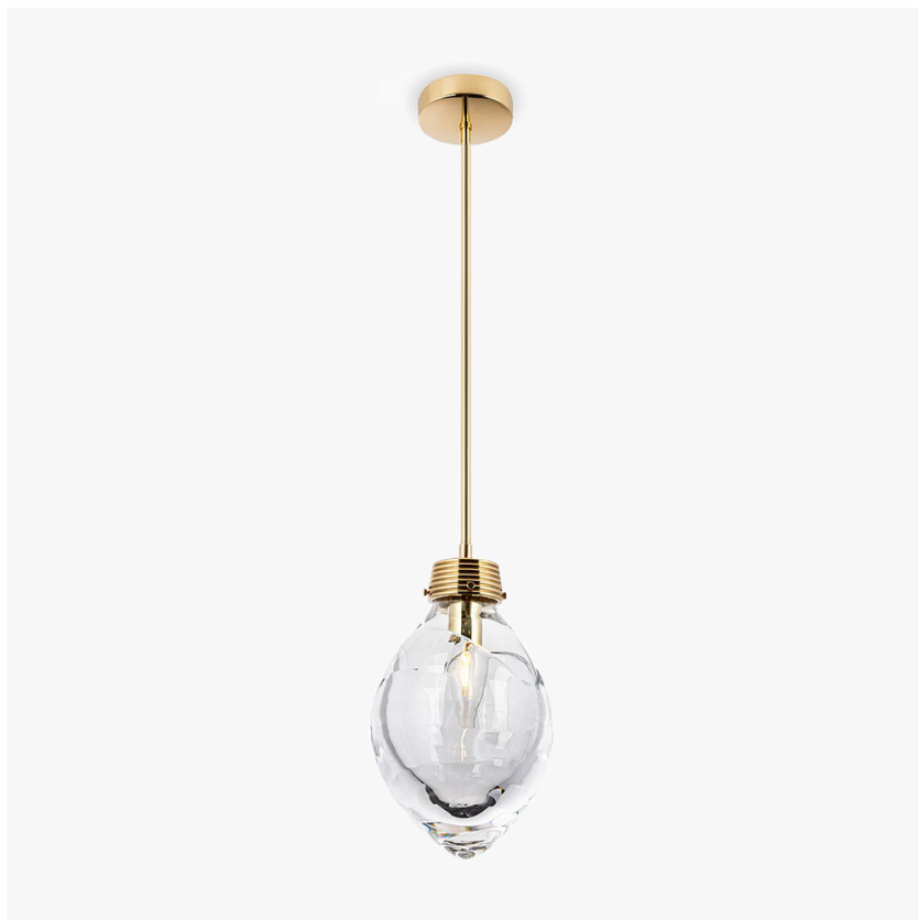
CL660-PEN in Clear Glass and Polished Brass