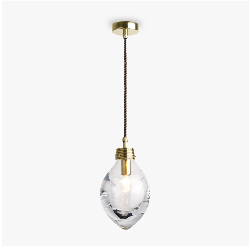
CL660-PEN in Clear Glass and Polished Brass with Brown Flex