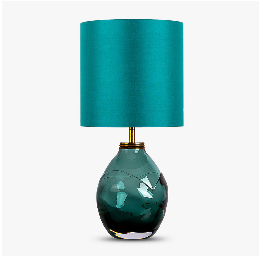
TL660 in Peacock Blue and Antique Brass with a 9" Tall Drum in Dupion 5018W-61