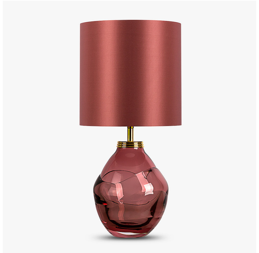
TL660 in Pale Aubergine and Polished Brass with 9" Tall Drum in Crepe Satin 1806W-306 Marsalla