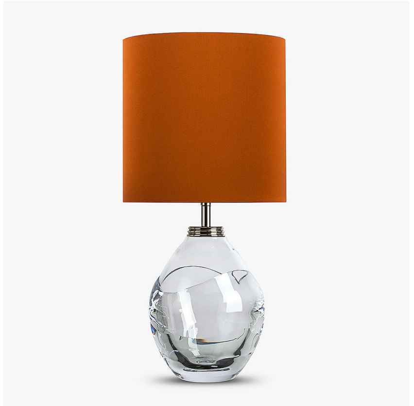
TL660 in Clear and Polished Nickel with 9" Tall Drum in Crepe Satin 1806W-140 Burnt Orange