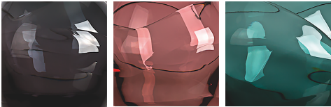
Ash Pale Aubergine Peacock Blue