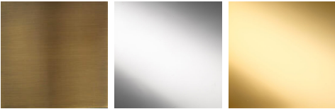
Antique Brass Polished Nickel Polished Brass