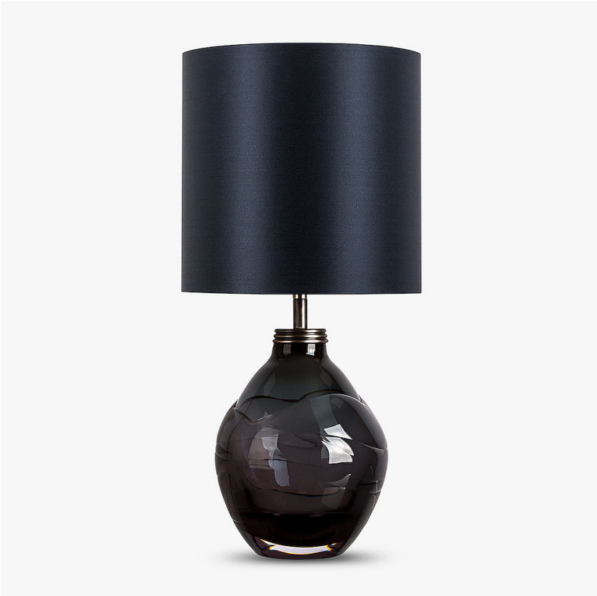
TL660 in Ash and Antique Brass with 9" Tall Drum in Crepe Satin 1806W-019 Indian Ink