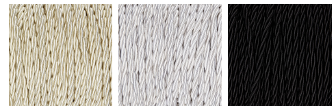
Cream Silver Black