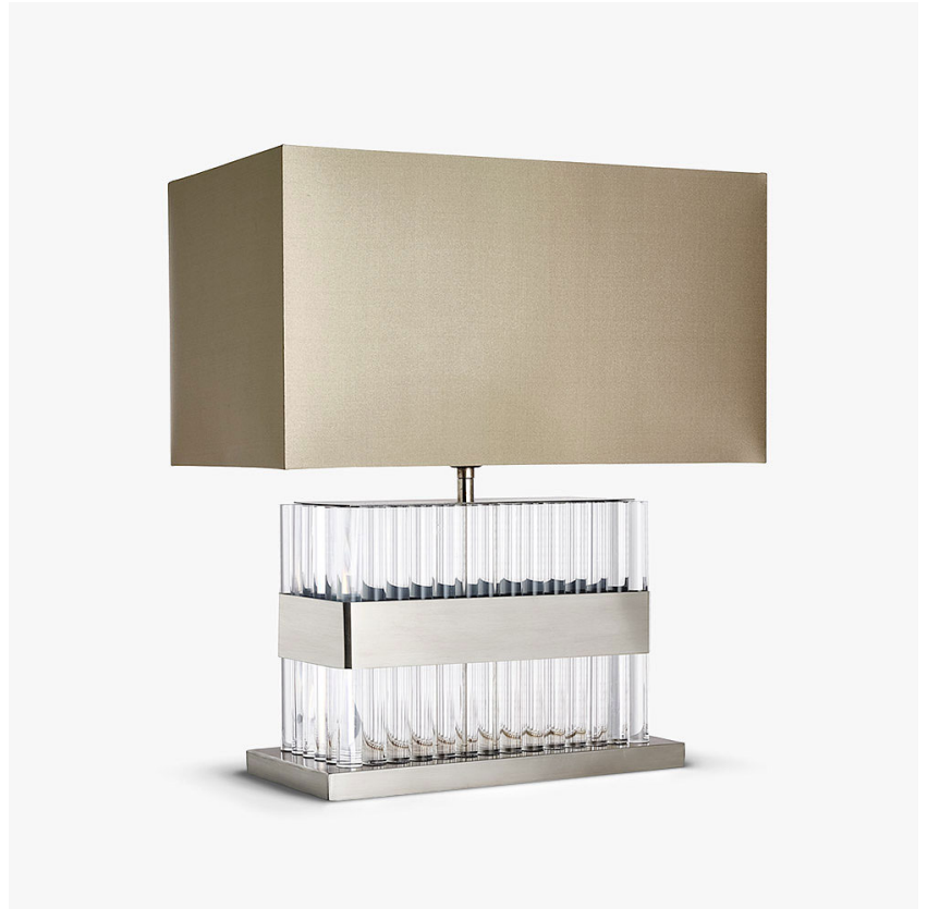
TL121-RECT in clear Lucite and brushed nickel with a 16 inch rectangular shade in silk crepe satin 1806W/ 310 Timber Wolf