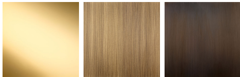
Polished Gold Antique Brushed Brass Bronze