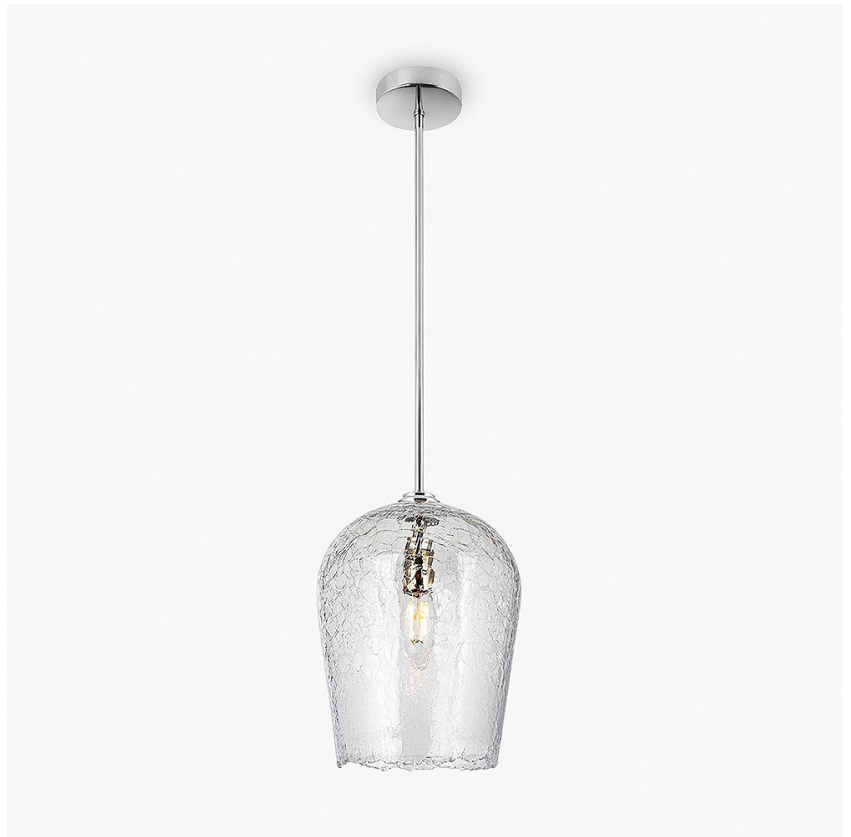
CL52 in clear crackled glass on a polished nickel rod

A classic pendant light with an artfully fractured edge and the crackled appearance of frozen ice, which encases the hand-blown glass beneath. Once lit, the refraction of light creates some truly exquisite patterns, which are unique to each pendant. Now available on a Polished Nickel rod.