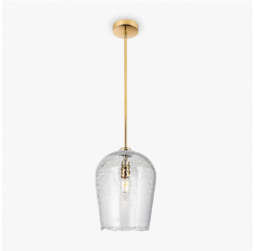
CL52 in clear crackled glass on a polished gold rod

A classic pendant light with an artfully fractured edge and the crackled appearance of frozen ice, which encases the hand-blown glass beneath. Once lit, the refraction of light creates some truly exquisite patterns, which are unique to each pendant.