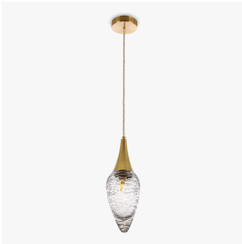
CL378 in clear lead crystal and polished brass with silver flex