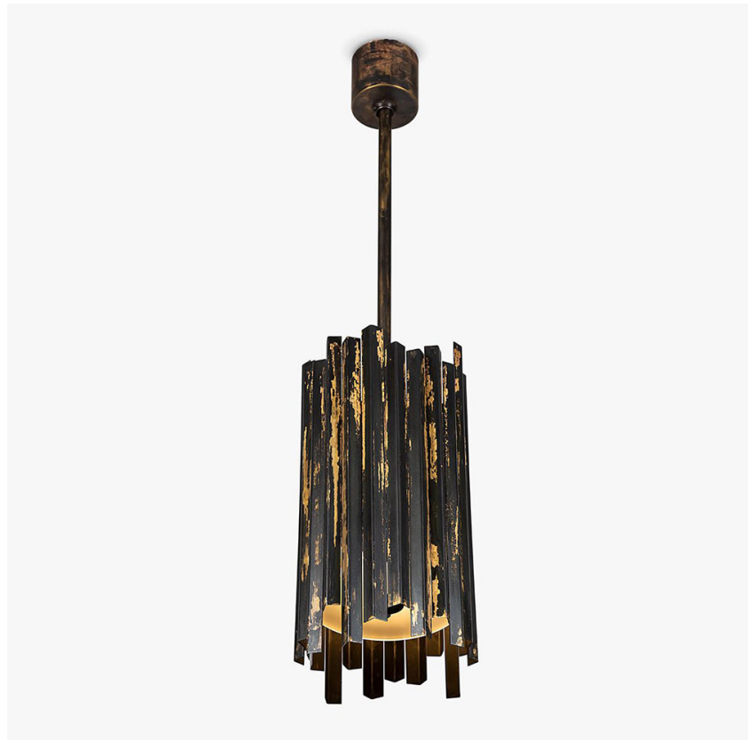
CL114-PEN in distressed bronze with a Lucite diffuser