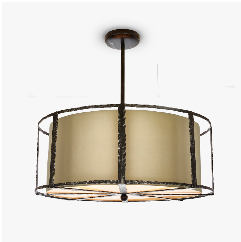
CL51-75 in hammered lead and crepe satin shade in 1806W/ 1012 Dust