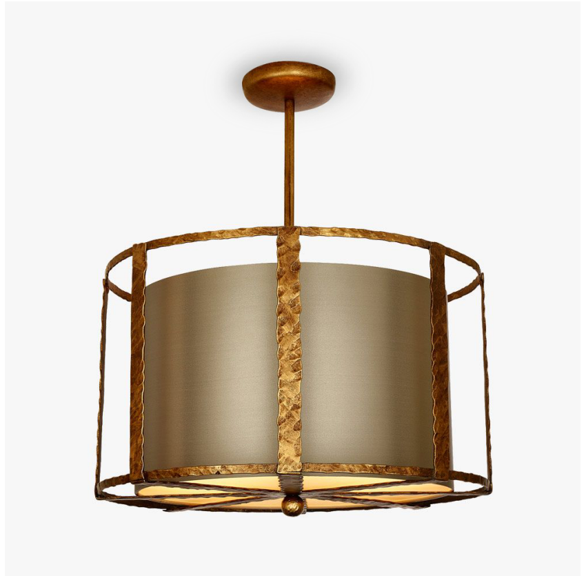
CL51 in hammered antique gold with CL51-50-Shade in crepe satin 1806W/ 310 Timber Wolf